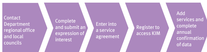
Figure 2: High level process for becoming a funded service provider

Service providers wishing to become an Early Years Management organisation see page 57.