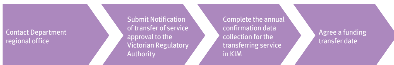
Figure 4: Transferring funding

Service providers wishing to add a service offering a funded kindergarten program that is currently being operated by another service provider should refer to How to transfer funding for a service below.